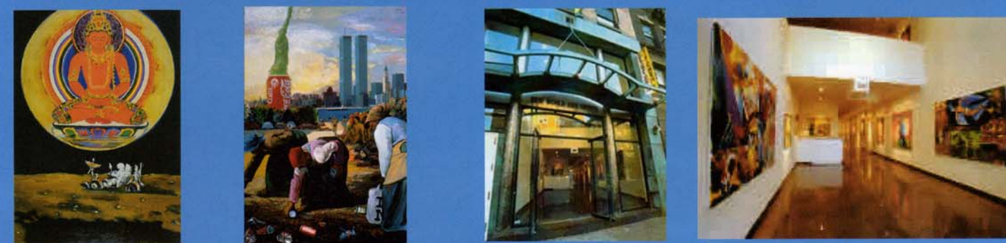
T.F. Chen Cultural Center (SoHo, NYC) Exterior Ground Floor & Mezzanine Level

ADVANCING ART EDUCATION & A GLOBAL CULTURE OF PEACE A WORLD TOUR 2005-2010