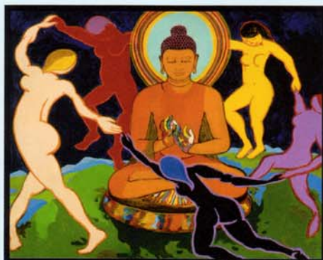
World Family in Peace

We gladly welcome contributions of time, goods, and professional services of all descriptions. If you would like to discuss additional opportunities to get involved, please contact us.