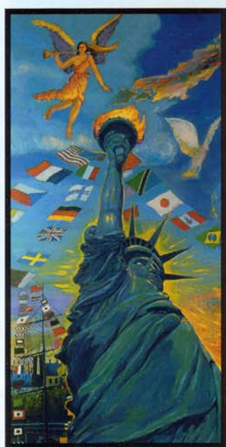
Salute to Liberty