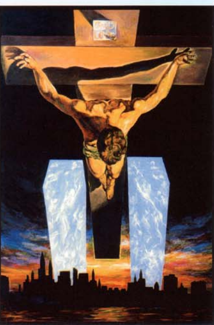
God is Love

Please read on to find out how you can support this vital mission and contribute to the creation of a new Global Culture.