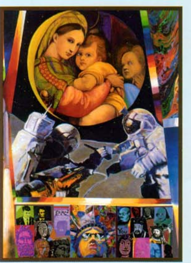
Age of Love