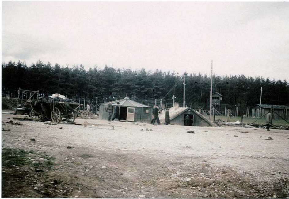
April 1945. Death camp barracks were built partially in the ground to avoid detection from the air.