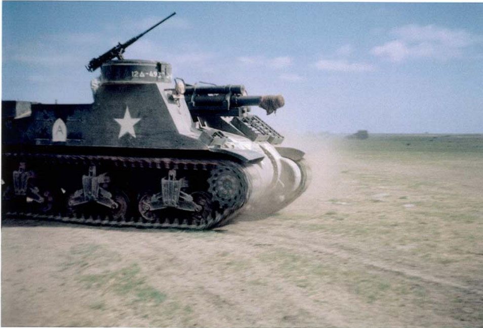
May 1944. The 12 th Armored Division in training exercises in Texas. The vehicle pictured is an M7 self-propelled artillery.