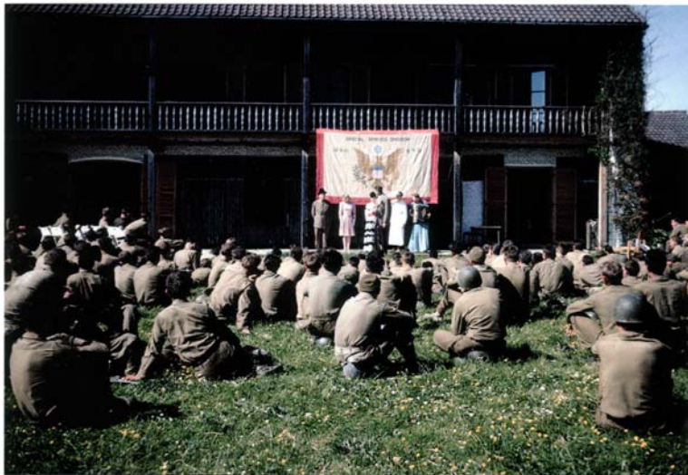
June 1945. The war in Europe is over. The men of the 12th AD watch their first USO show.