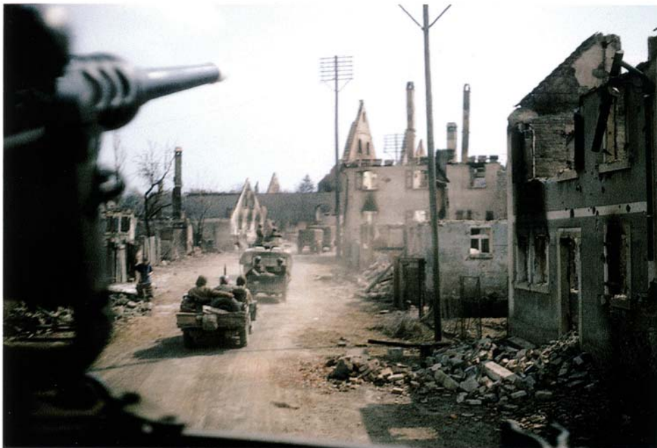
March 18, 1945. The 12 th Armored Division in Nazi Germany, moving rapidly toward the Rhine River, sixty miles away. The destruction visible in the town was the result of Allied artillery and aerial bombardment.